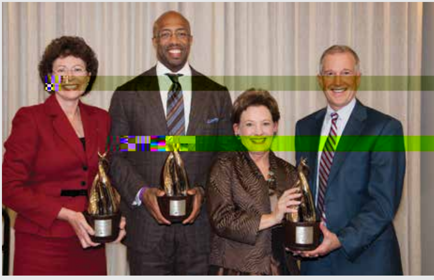
Aimed at providing a global academic, clinical, and research community with a platform for exchanging ideas and methods in multiple sclerosis research, the 2015 LUMINARY Awards ceremony was held at the University of Sydney on 11th November 2015. The event was a significant milestone for the University of Sydney, as it was the first time that the awards were presented to a group of researchers from a single institution. The ceremony was attended by a large number of researchers from around the world, and it was a great opportunity for them to share their work and to learn from each other. The awards were presented to a group of researchers from the University of Sydney, and they were all well-deserved winners. The ceremony was a great success, and it was a pleasure to be part of it.